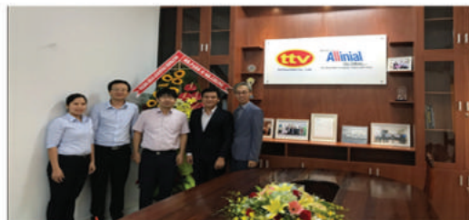
Ghilin Accounting - member of Allinial Global in Korea visiting and meeting with TTV