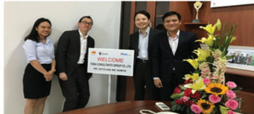
Toma Consultant Group - Tokyo, Japan visiting and meeting with TTV