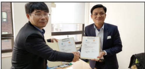
Cooperation Agreement between Trithucviet and Ghilin Accounting Corporation - member firm of Allinial Global in Korea