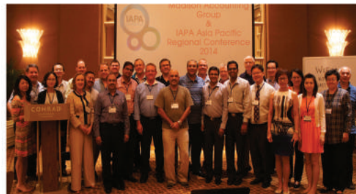
Trithucviet participated in the Asia Pacific Conference of IAPA International