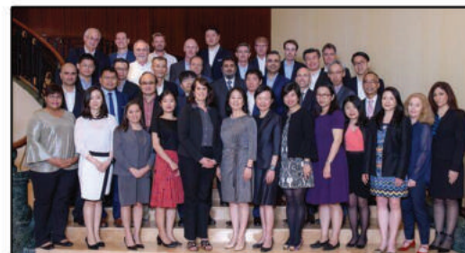
AG Asia Pacific Conference 2018 in Hong Kong