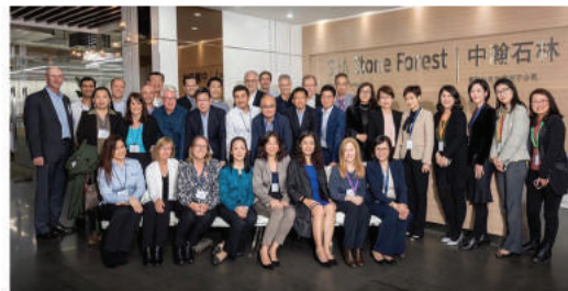
AG Asia Pacific Conference 2017 in Shanghai, China