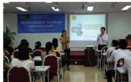
Trithucviet coordinated with the General Department of Taxation to provide tax training, transfer pricing services. . . .